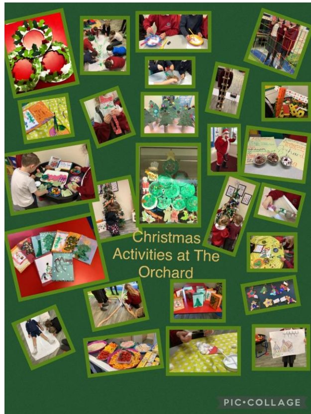
2 - Children at The Orchard have been doing lots of festive activities, too!