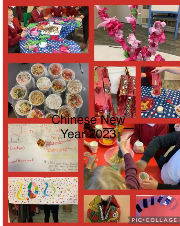
2 - The children who attend The Orchard have been enjoying some Chinese New Year activities.