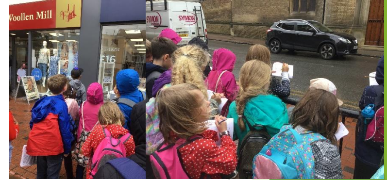
Year 4- Fieldwork