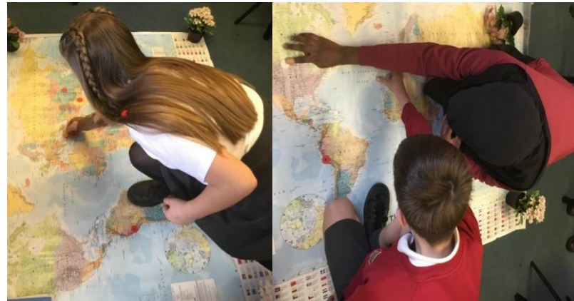
Year 6- Map Skills during Fair Trade?