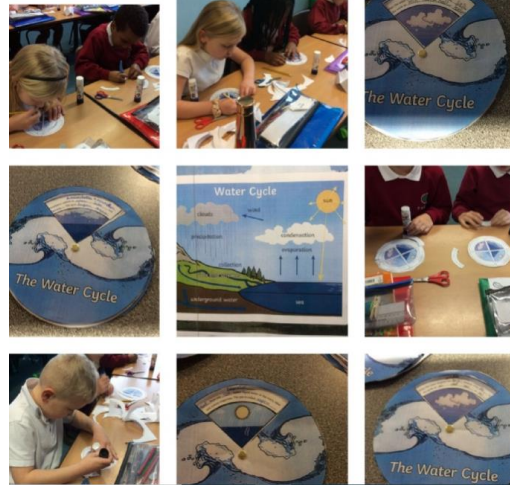
Year 3- The Water Cycle