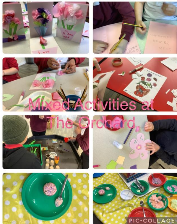
1 - Children at The Orchard did variety of activities to celebrate people who help them grow.