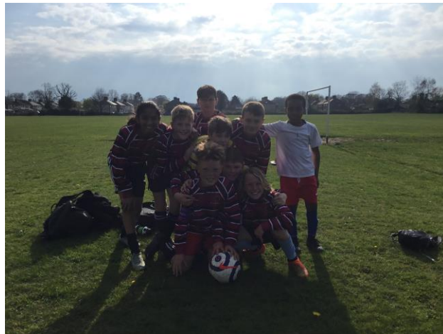
2 - Congratulations to the Year 5 football team for their victory on Monday.