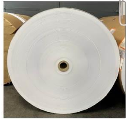
Our rolls start like this...