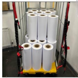
Ready to recycle!

(the centres of the rolls are too small to be used on the machines)