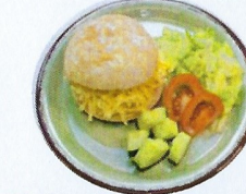
(v) Cheddar Cheese D.G.