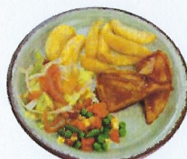
(vg) Sticky BBQ Quorn Fillet G.