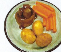
(v) Veggie Toad in the Hole D.E.G.