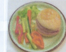
HAM ROLL G.