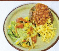
(v) Cheese/Beans D