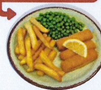
Breaded Fish Fillet Fingers F.