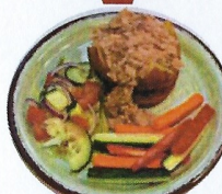
Tuna Mayonnaise F.E.