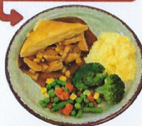
Chicken Pie G.