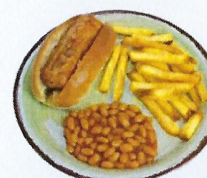
(v) Veggie Hot Dog G.