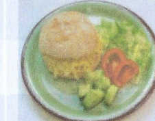
CHEESE ROLL D.G.