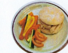
British Roast Chicken G.