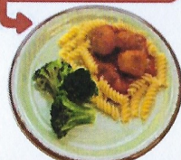
Pork Meatballs SB, SU