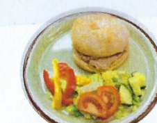
Tuna Mayonnaise F.E.G.