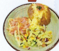
(v) Cheese D.