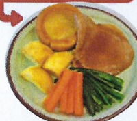
Roast Beef in Gravy, York Pud D.E.G