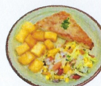
(v) Cheese & Tomato Pizza G.D.